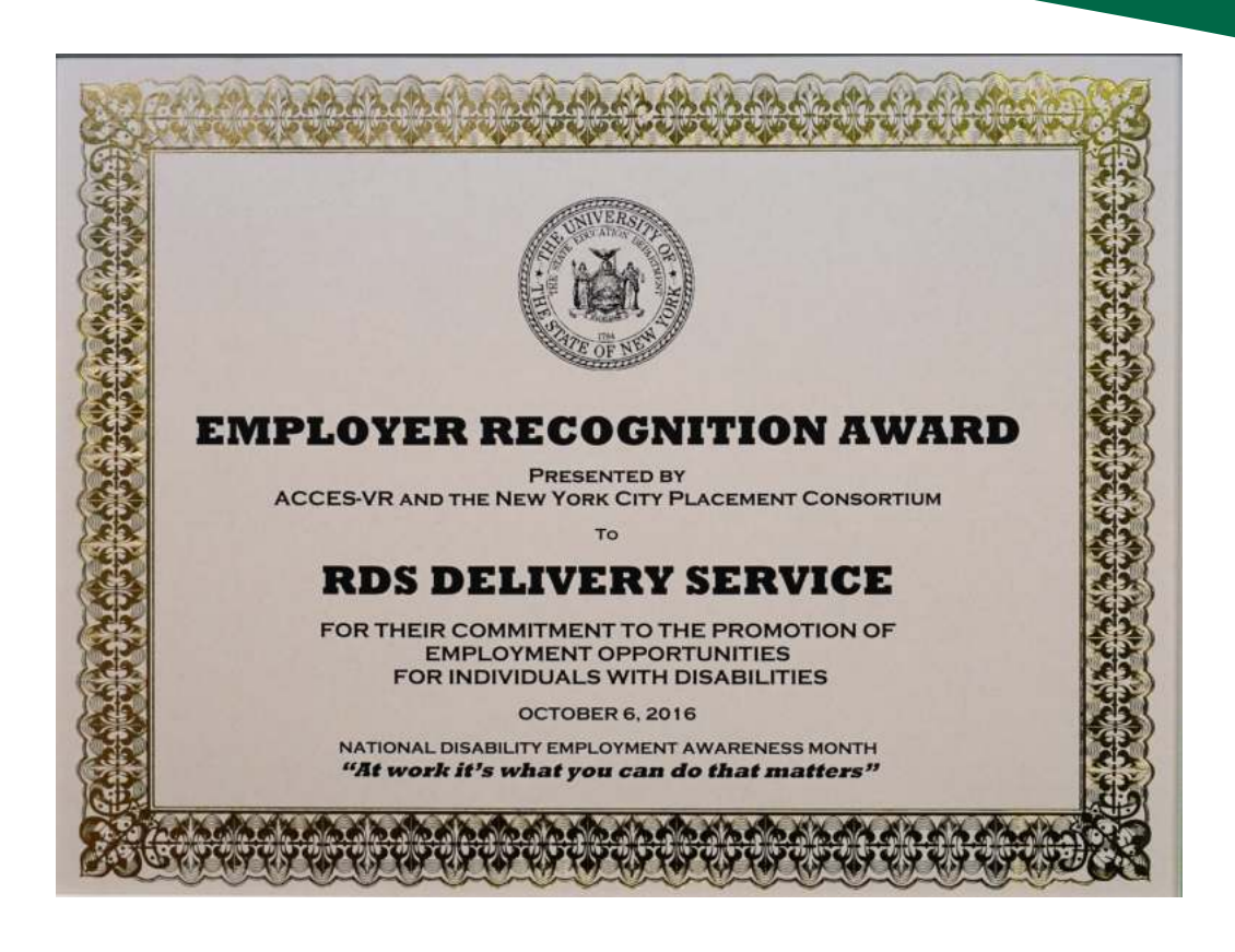
Employer Recognition Award Presented by Access-VR & the New York City Placement Consortium.

For Commitment to the promotion of employment opportunities for individuals with disabilities.